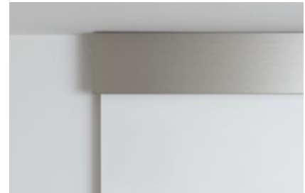
◀ RS 120 Low-noise roller carriers in sturdy track rails are concealed behind the color-giving cover profile